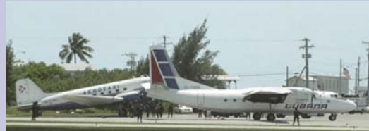
Two hijacked planes from Cuba land at Key West International Airport