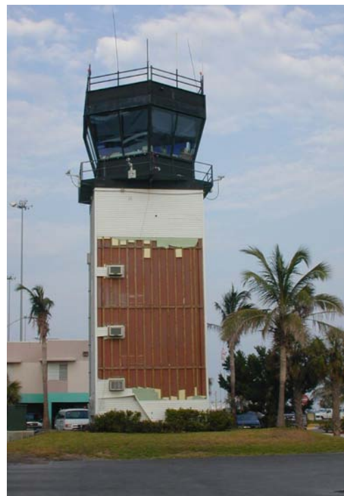
Damage to Key West International Airport's control tower after Hurricane Wilma